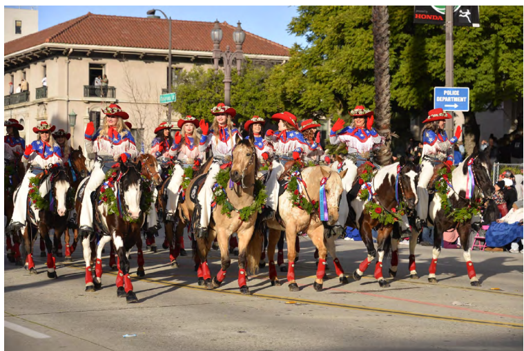
Norco Cowgirls Rodeo Drill Team.