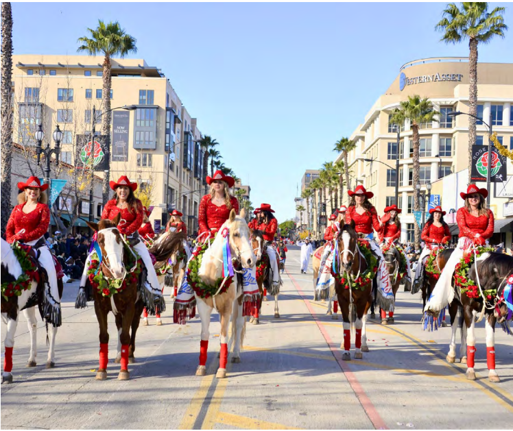
The Painted Ladies Stunt Team riding in the parade.