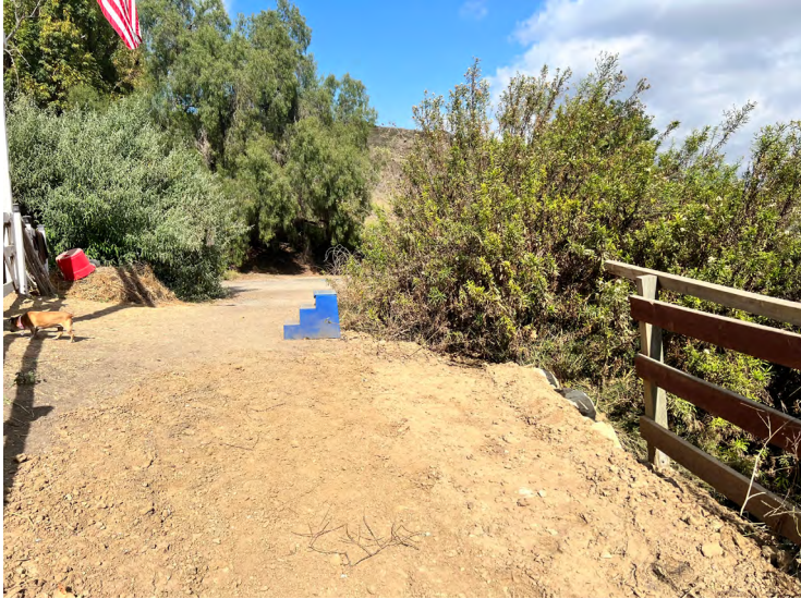
The restored trail. I only wish I had a "before" photo so you could see how much work was done here.