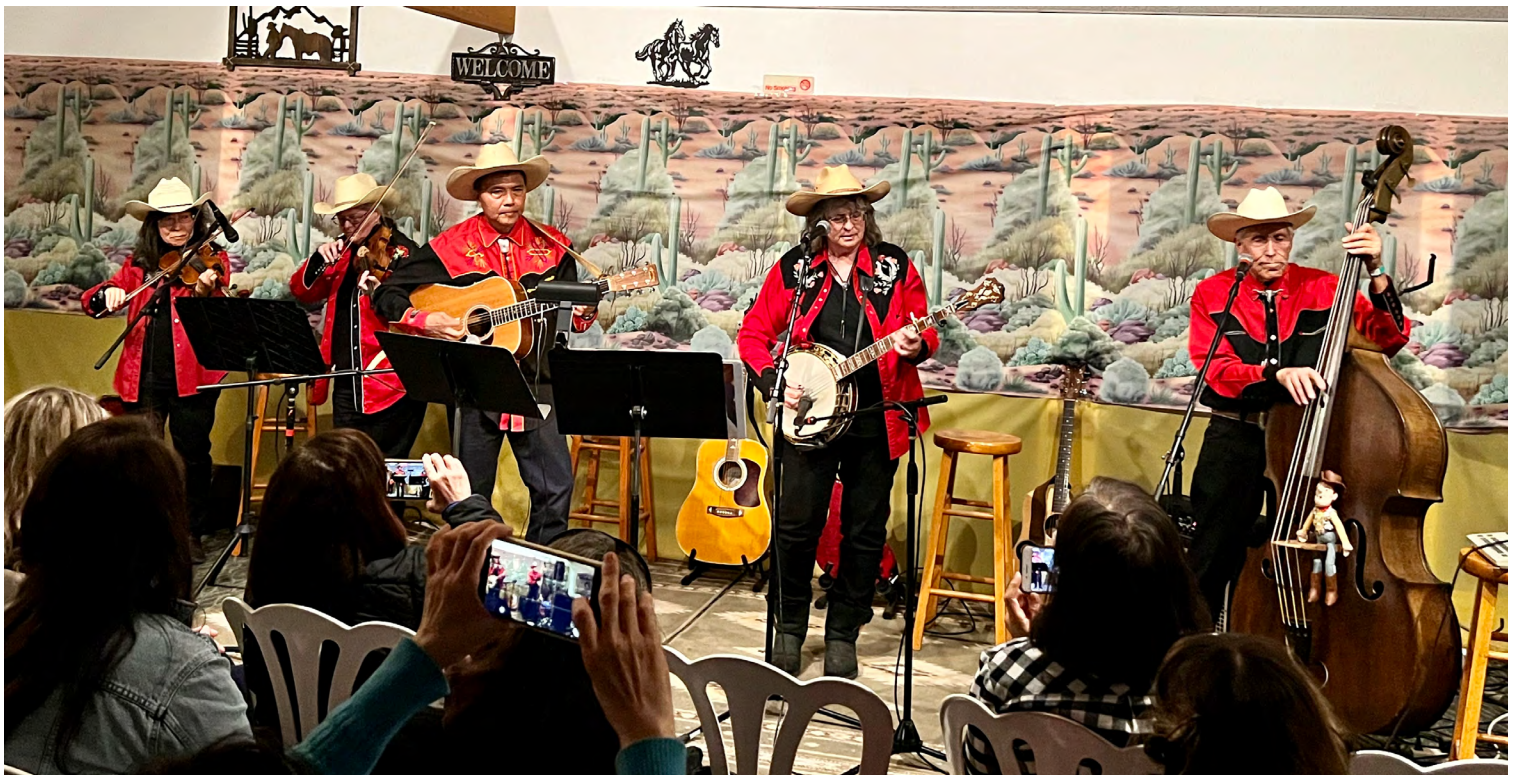
The Windy Ridge Bluegrass Band plays all over SoCal for most any occasion. This band shares their enjoyment of music and harmony through traditional bluegrass, contemporary, originals, and gospel.