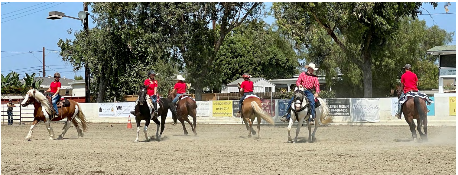
Happy Hooper Drill Team presentation at the Rolling Hills Estates City Celebration September 25, 2021.

P.O. BOX 3544 Palos Verdes Peninsula, CA 90274 equinedvm@tshepa.net